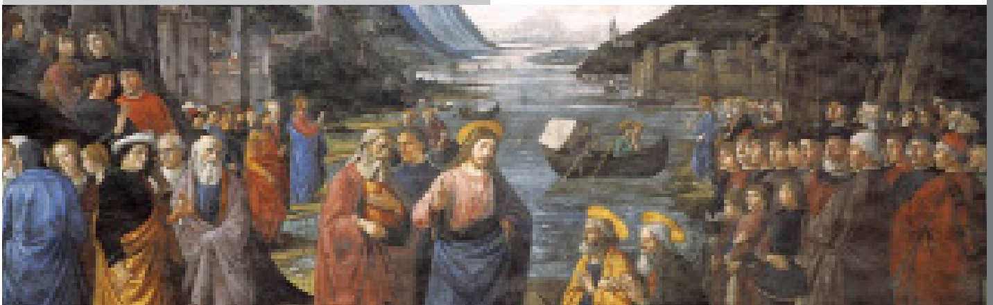
Vocation of the Apostles (1481) by Domenico Ghirlandaio

May we remain docile, gentle, and respectful with one another, listening as brothers in Christ. As we learn from Him, may we be equipped to serve with humility and love.