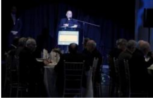
The Provincial welcomes those in attendance