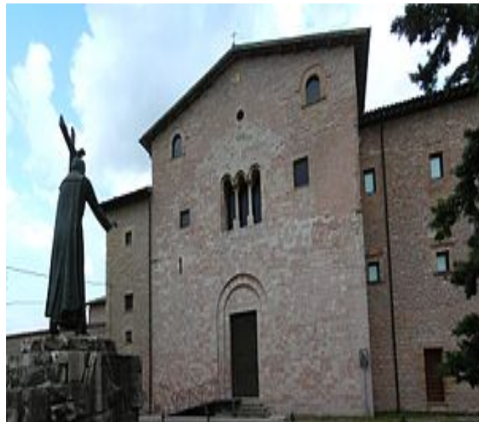
Abbey of San Felice, Giano

With this in mind, I hope to hear from members of the province about how you see a renewed future unfolding. I would like to include your thoughts in this space to keep a dialogue going and to help the General and the council best prepare for next year's retreat.