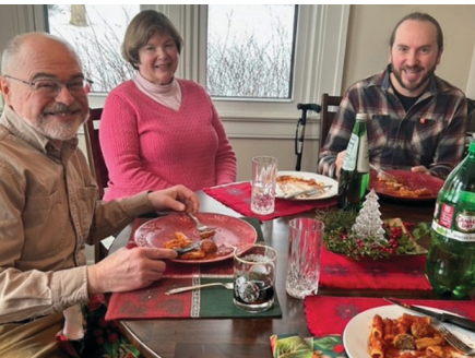
A table of friendship and gratitude—nourished in body and spirit at Giano Mission House.

Members gathered at Merlini House to celebrate the feast of St. Francis Xavier, patron of the Missionaries of the Precious